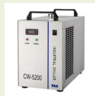
S&A CW5200 Water Cooling machine