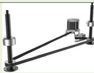
Optional:Electronic lifting The machine can automatic adjust the working table to satisfy the demands of cutting different thicknesses materials.The lifting height can reach 20cm.