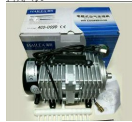
Blow air, air pipe on the laser head. Avoid burning& keep lens clearly.