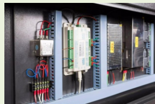
Perfectly Tidy Power Supply System