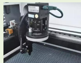
Optional:Camera pick up positioning, San the material, cutting more efficient and precision