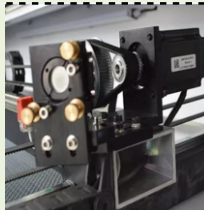
Reflect 45° mirror adjustment set.Three -point dimming bolt for easier dimming