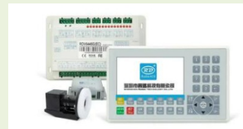
Ruida's latest offline color screen control card