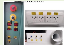
Independent control of built-in fan ,air pump, water chiller.